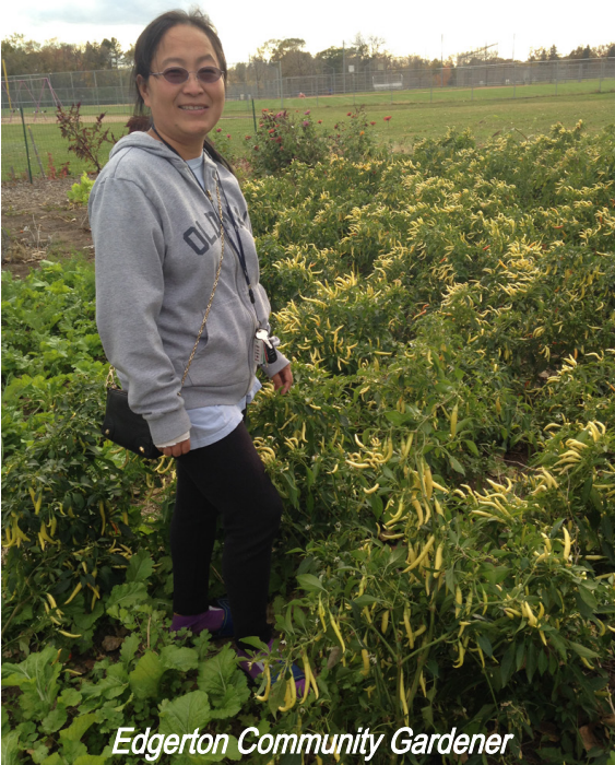
Edgerton Community Gardener