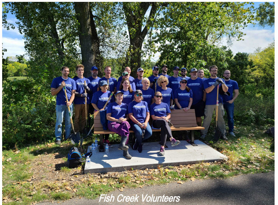
Fish Creek Volunteers