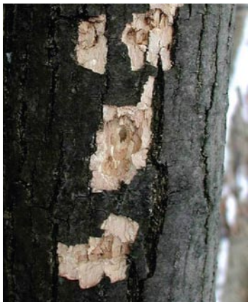
Figure 6. Jagged holes left by woodpeckers feeding on larvae.