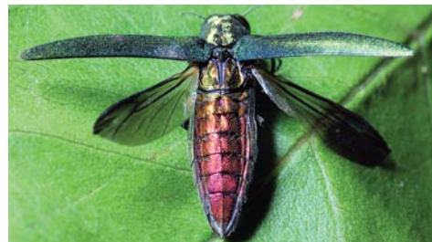
Figure 2. Purplish red abdomen on adult beetle.