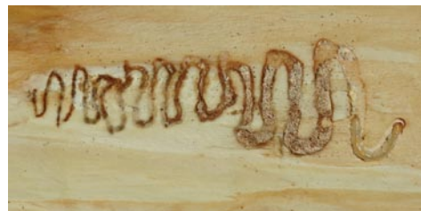
Figure 4. Gallery of an emerald ash borer larva.