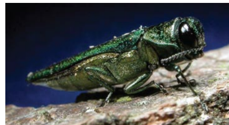
Figure 1. Adult emerald ash borer.

Prepupal larvae overwinter in shallow chambers, roughly 1 cm deep, excavated in the outer sapwood or in the bark on thick-barked trees. Pupation begins in