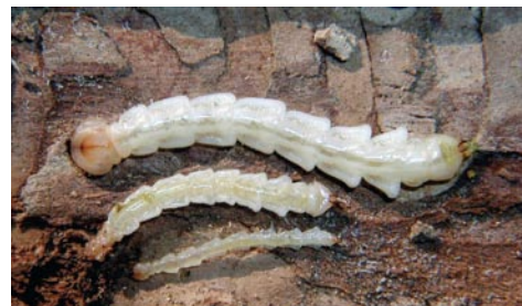
Figure 3. Second, third, and fourth stage larvae.