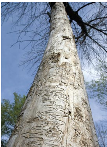
Figure 7. Ash tree killed by emerald ash borer. Note the serpentine galleries.