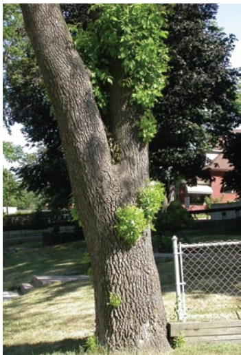
Figure 8. Epicormic branching on a heavily infested ash tree.

late April or May. Newly eclosed adults often remain in the pupal chamber or bark for 1 to 2 weeks before emerging head-first through a D-shaped exit hole that is 3 to 4 mm in diameter (Fig. 5).