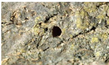
Figure 5. D-shaped hole where an adult beetle emerged.